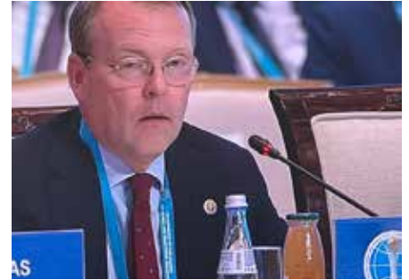
Christophe Kamp, High Commissioner on National Minorities, Dutch Ministry of Foreign Affairs.