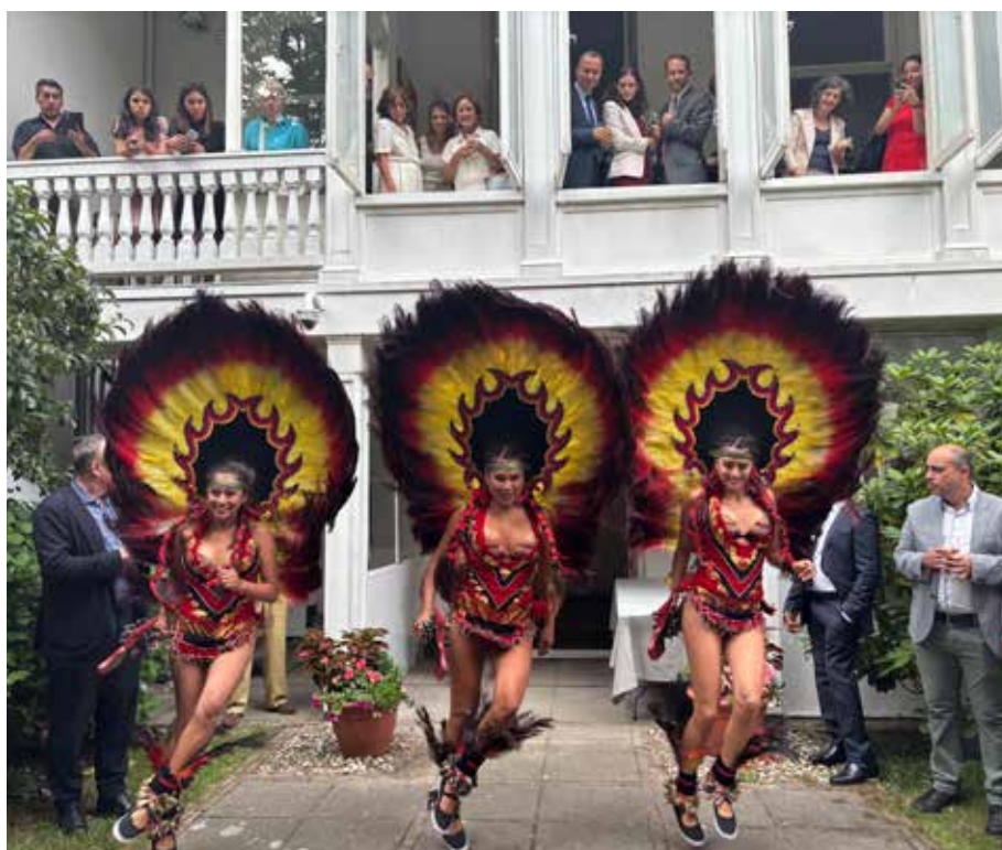
Alma Latina dance group.

The celebration continued with colorful performances by the Alma Latina dance group, featuring Tobas and Morenada dances that filled the evening with rhythm and joy. Guests were treated to Bolivian specialties