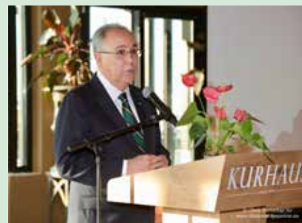
H.E. Fernando Simas Magalhães, ambassador of Brazil.

The cultural segment also included a lively performance by Roda da Holanda, a renowned ensemble dedicated to Brazilian music that will celebrate its 10th anniversary