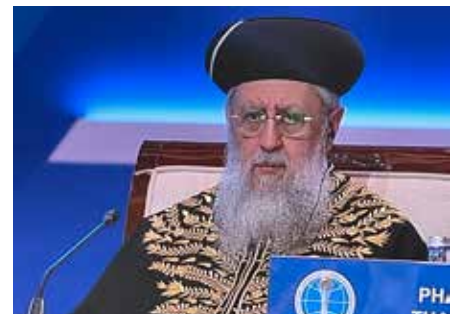
3 - Rabbi David Yosef, Sephardi Chief Rabbi of Israel