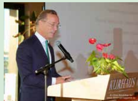
H.R.H. Prince Jaime de Bourbon de Parme