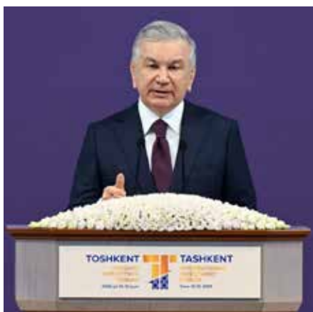
President Shavkat Mirziyoyev opens Tashkent International Investment Forum 2025

This year's opening concluded on a celebratory note with the FIFA World Cup qualifier between Uzbekistan and Qatar, attended by President Mirziyoyev and high-level international guests. Uzbekistan's national team triumphed 3–0, securing its first-ever qualification for the FIFA World Cup — a historic moment for the nation.