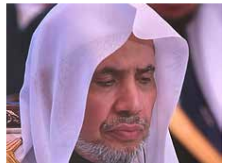
4 - Sheik Mohammed bin Abdulkarim Al-Issa, Sec Gen of the Muslim World League

President Tokayev's call for a Movement for Peace, rejecting any link between terrorism and religion, nationality, or ethnicity.